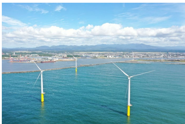
Akita Port Offshore Wind Farm

Marubeni is pleased to announce that it started commercial operation based on the feed-in tariff program for renewable energy (hereinafter, “FIT”) at Akita Port Offshore Wind Farm on January 31, 2023.